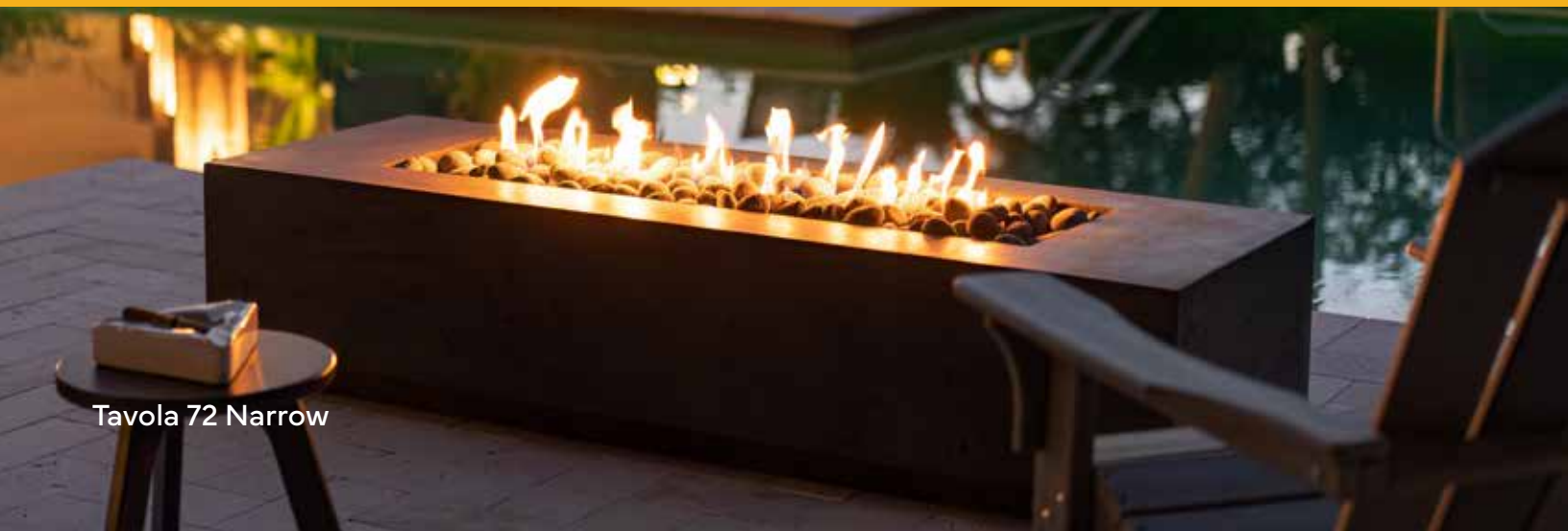
Tavola 72 Narrow